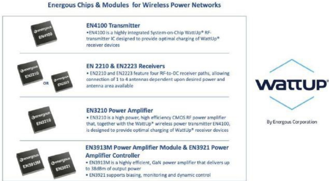
Figure 1 below shows the current IC product line for Energous:

Our small form factor antennas and one transmitter to multiple receivers capabilities produce significant advantages over RF-beamforming transmitters, which are larger, and higher cost wireless power technology implementations. Our current generation ICs have significantly reduced the size and cost of both transmitter technology and our receiver technology, and products under development are designed to further reduce size and cost. In addition, our ICs are designed for both lower-power and higher-power applications, efficiency and faster synchronization, while working within the constraints of multiple international regulatory environments.