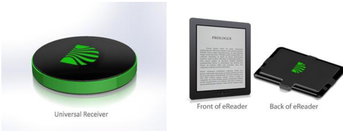
Figure 4: Computer generated images of additional devices under development

Currently, our demonstration system is able to output wattage to three devices at a distance of 15 feet with the ability to refocus the RF pocket within 1 second. While our demonstration system employs off-the-shelf components, we are developing several ASICs that we believe will enable our future system designs to deliver multiple watts at a distance of up to 30 feet, and to refocus the RF pocket within fractions of a second. We believe our ASICs in development will allow us to significantly reduce our transmitter size and costs and achieve higher delivered power.