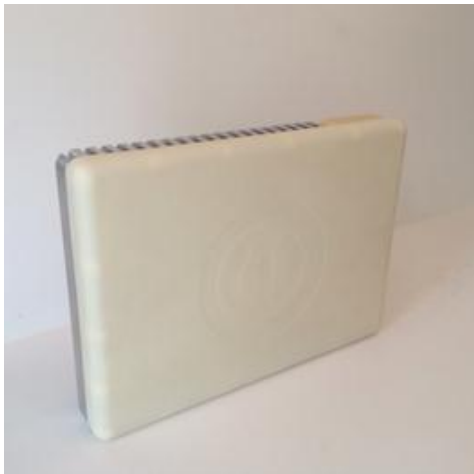
Figure 2: Prototype Transmitter in Plastic Enclosure

Figure 2 below shows our prototype transmitter in its current enclosure. This enclosure has dimensions of approximately 12" x 8.5" x 2".