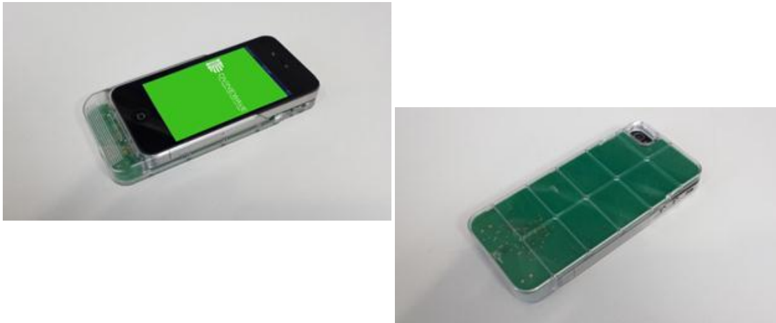
Figure 3: Front and back of our smart phone cover with embedded DvineWave receiver technology

Below, in Figure 4, are additional receiver devices under development, including e-book reader and universal receiver.